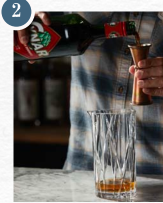
2 ADD 1.0 OZ CYNAR