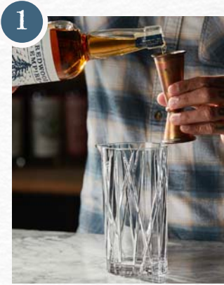
1 POUR 1.5 OZ OF LOST MONARCH WHISKEY BLEND