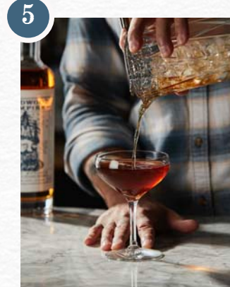
5 POUR INTO A COUP GLASS