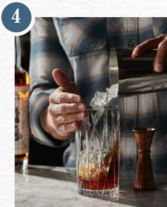
4 ADD ICE