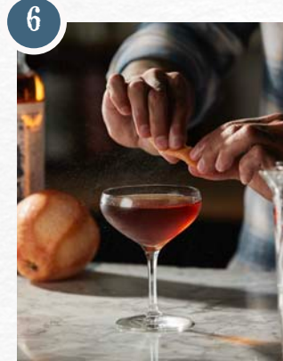
6 GARNISH WITH GRAPEFRUIT PEEL TOOTHPICK